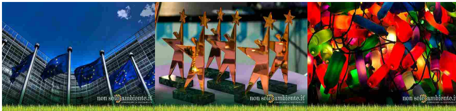
Europe has a Green Deal